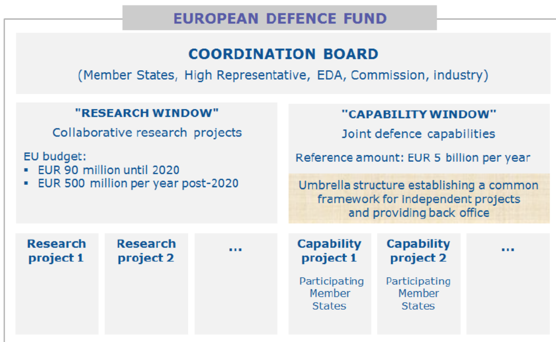
Figure 1. European Defence Fund (management and amounts)